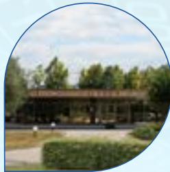
MOLISE Region - Pozzilli (Is) - Italy