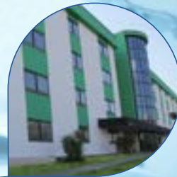
CAMPANIA Region - Caserta - Italy